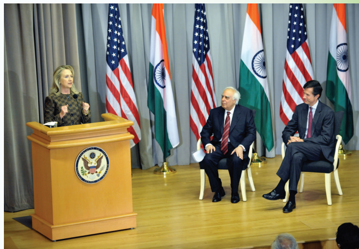
Shri Kapil Sibal is seen on the dais as Ms Hillary Clinton, US Secretary of State addressed the Indo-US Higher Education Dialogue in Washington, D.C. on June 12, 2012.

Taking the educational partnership between India and the US a step forward, the second Indo-US Higher Education dialogue was held in Washington, D.C., United States, on June 12, 2012. Shri Kapil Sibal, the then Minister of HRD and US Secretary of State, Ms Hillary Clinton, were co-chair at the dialogue.