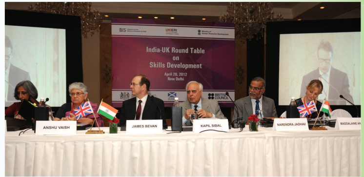
Shri Kapil Sibal and other dignitaries at the India-UK Round Table on Innovation and Skills Development, in New Delhi, on April 20, 2012.

In his speech, Shri Sibal, said "Economic resources defined the milestones of the 20th century but the defining story-line of the early 21st century will be that of human resources. Today's challenges are qualitatively different from the past in their global