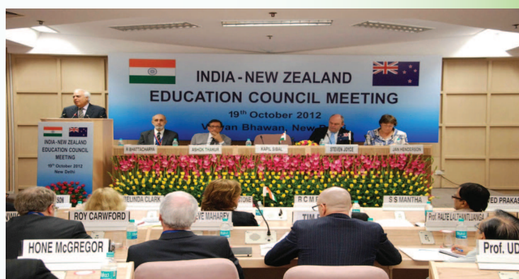
Shri Kapil Sibal, the then Minister of HRD, addressing the meeting

The two Ministers discussed the scope of cooperation and further collaborations in the fields of academia, business and industry. Collaborations for the