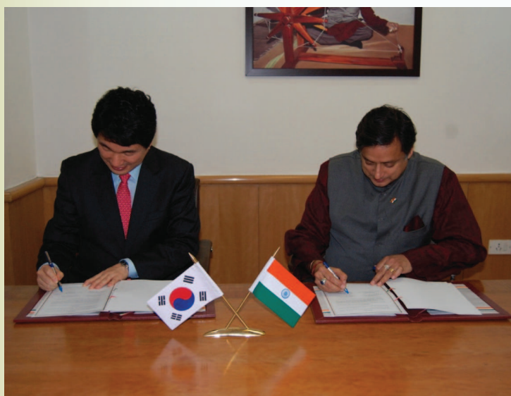
Dr. Shashi Tharoor, MoS of HRD and Dr. Lee Ju-Ho, Minister of Education, Science and Technology, Republic of Korea signing the MoU.

According to the MoU, the two countries will cooperate in education through Exchange of scholars, teachers, researchers; organization of training programmes for teaching professionals; facilitating mutual recognition of educational qualifications; exchange of academic scholarships for Higher Education, etc. The two countries are also going to form a Joint Working Group (JWG) to supervise the implementation of the programmes enlisted in the MoU.