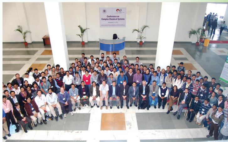
The leading Indian and German chemists as well as young researchers of IISER, Bhopal, pose together.

attended by delegates from the German embassy, DFG and DAAD.