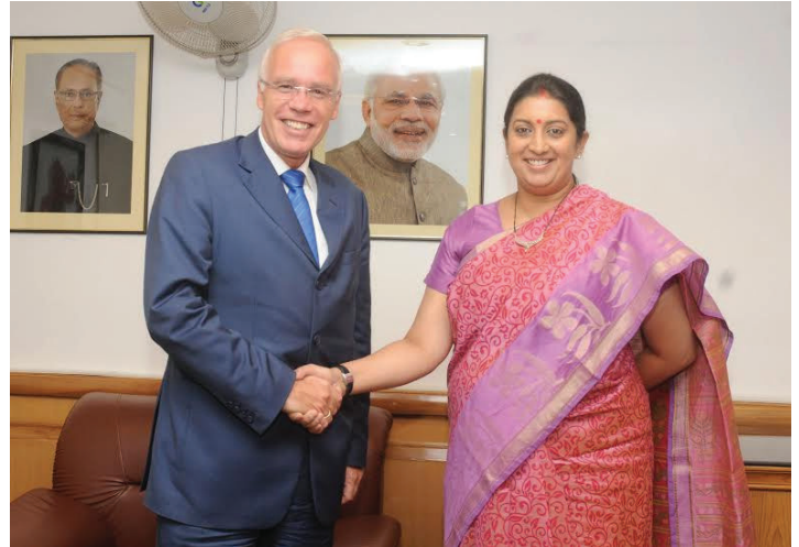
Mr. Eivind S. Homme, the Ambassador of Norway to India, calling on Smt. Smriti Zubin Irani, Minister of HRD, on July 22, 2014.

In a meeting dated July 22, 2014, Smt. Smriti Zubin Irani, Minister of HRD and Mr. Eivind S. Homme, Ambassador of Norway to India discussed the collaboration between India and Norway for high altitude studies at the National Institute of Himalayan Studies which was announced in the General Budget 2014. Smt. Irani also emphasized on collaboration in the area of energy studies.