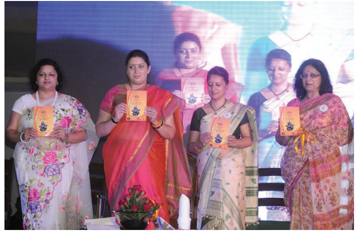
Smt. Smriti Zubin Irani, Minister of HRD, releasing the 'Handbook for NSG Commandos and Families' at a function of the NSG Wives Welfare Association, at Manesar, Haryana, on July 20, 2014.

On July 20, 2014, Smt. Smriti Zubin Irani, Minister of HRD, was the Chief Guest at the first Foundation Day celebration of the NSG Wives Welfare Association (NWYA). On the occasion, a theme-based musical dance show, "Shaurya - Ek Abhiviyakti," was also organized.