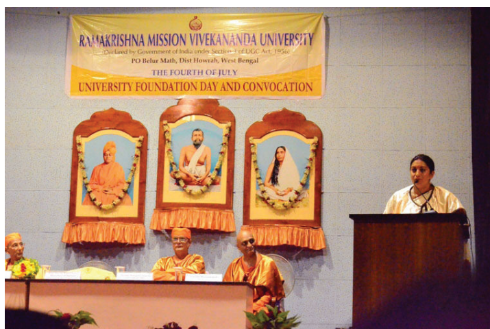
Smt. Smriti Zubin Irani, Minister of HRD, speaking at the Ninth Foundation Day and Annual Convocation of Ramakrishna Mission Vivekananda University at Belur Math, West Bengal on July 4, 2014.