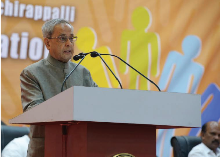
The Hon'ble President of India, Shri Pranab Mukherjee, addressing at the inauguration of the Golden Jubilee celebration of National Institute of Technology, at Tiruchirappalli, in Tamil Nadu on July 19, 2014.

On July 19, 2014, the Hon'ble President of India, Shri Pranab Mukherjee, inaugurated the Golden Jubilee celebrations of the National Institute of Technology Tiruchirappalli.