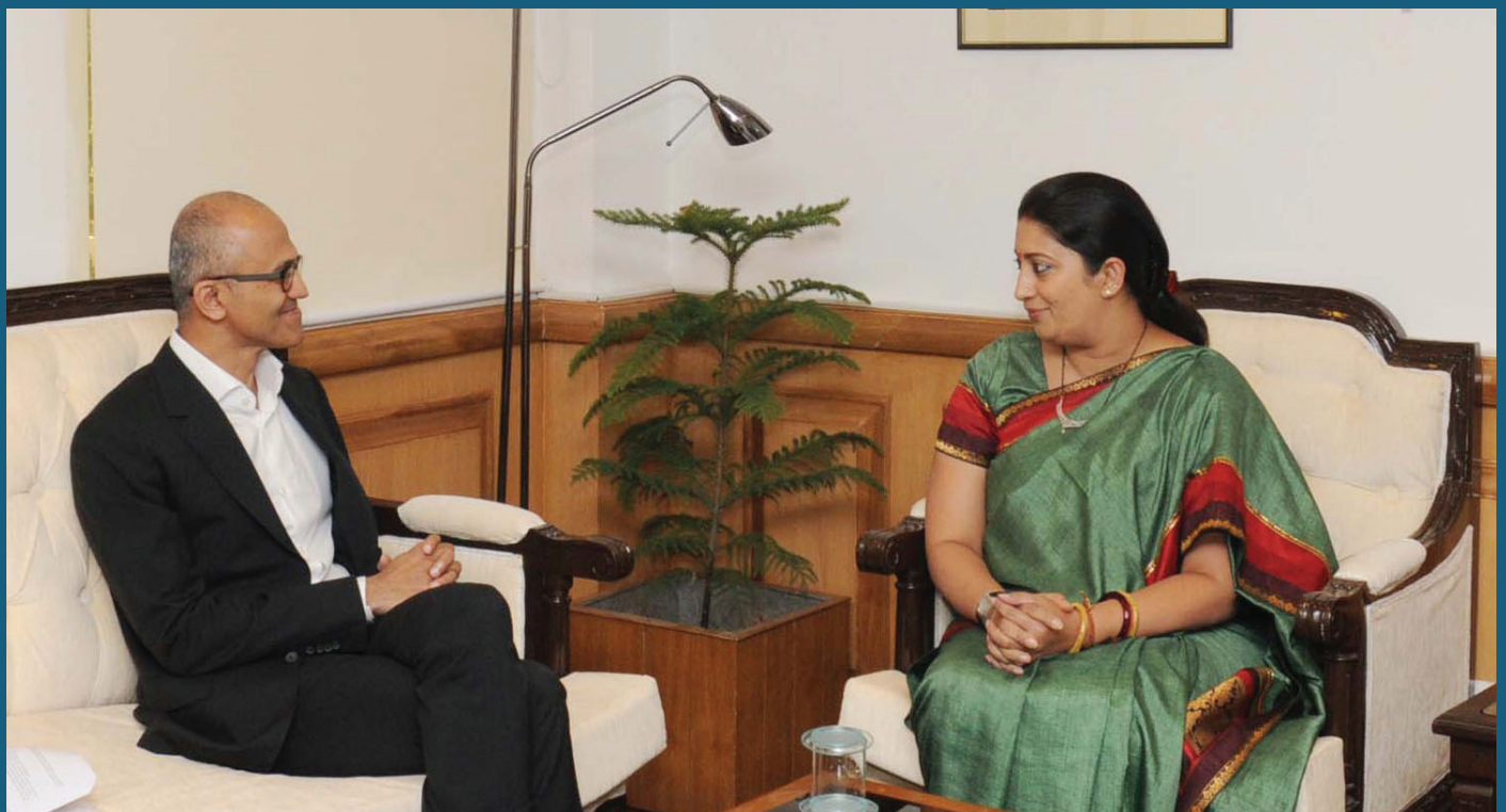
Shri Satya Nadela, CEO, Microsoft, calling on Smt. Smriti Irani, Minister of HRD, in New Delhi on September 30, 2014.

Details of the programme are also available on site olin.wustl.edu/embamumbai or som.iitb.ac.in/jointEMBA . The MBA degree will be conferred to these executives jointly by IIT Bombay and WUSTL. The participants will benefit personally and professionally in enhancing their knowledge to enable them being responsible innovative global leaders of tomorrow.