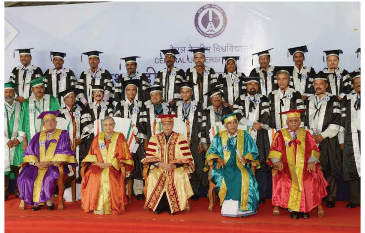
The Hon'ble President of India, Shri Pranab Mukherjee, at the First Convocation of the Central University of Kerala, at Kasaragod, on July 18, 2014. The Governor of Kerala, Smt. Sheila Dixit, the Chief Minister of Kerala, Shri Oommen Chandy and other dignitaries are also seen.

The Hon'ble President of India, Shri Pranab Mukherjee, who was speaking at the first Convocation of the Central University of Kerala in Kasaragod on July 18, 2014, said that India's success lies in mobilizing all the positive forces to fight the scourges of poverty, deprivation and backwardness. At the same time, he said, the success of students lies in becoming the agent of change, the catalyst in mitigating the hardships and sufferings of the people. Shri Mukherjee was of the opinion that by the virtue of having access to Higher Education, the students were privileged as well as morally responsible to do that.