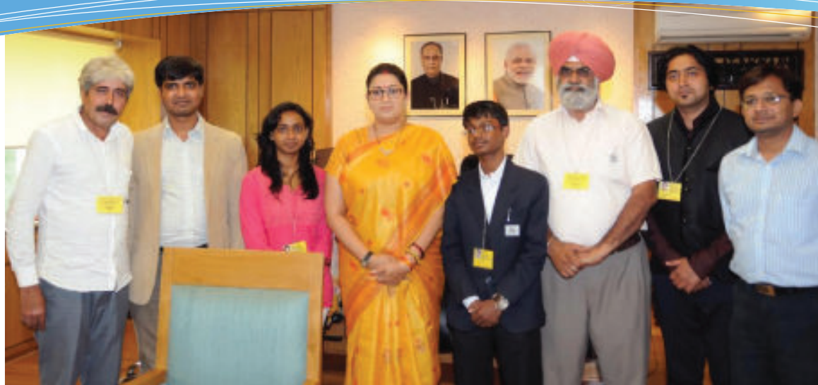
Smt. Smriti Zubin Irani, Minister of HRD, meets innovation scholars of the 'In-Residence' Programme, in New Delhi on July 15, 2014.