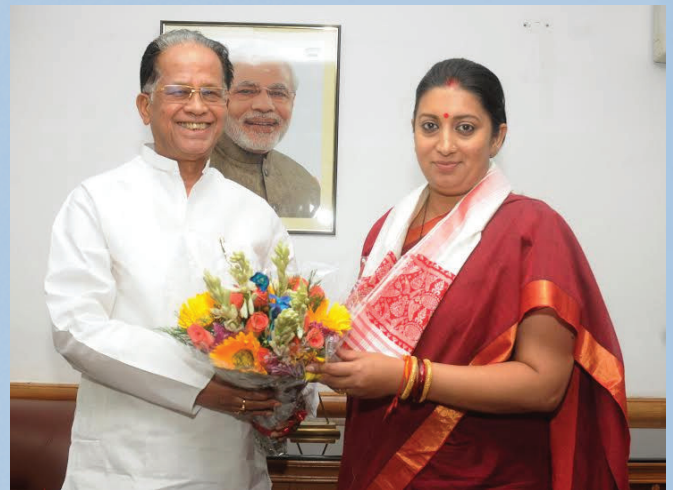
Shri Tarun Gogoi, Chief Minister of Assam, calling on Smt. Smriti Zubin Irani, Minister of HRD, in New Delhi on July 8, 2014.

Shri Tarun Gogoi, Chief Minister of Assam, called upon Smt. Smriti Zubin Irani, Minister of HRD, in New Delhi on July 8, 2014. During the meeting, Shri Gogoi discussed the education scenario in the state with the HRM and apprised her of the schemes being implemented by the State Government for the improvement of the same.