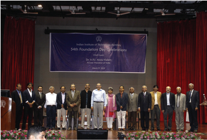
Awardees at the IIT Bombay Foundation Day celebrations ceremony in Mumbai on March 11, 2013.

The Indian Institute of Technology, Bombay, organized the celebration ceremony of its 54th Foundation Day Anniversary on March 11, 2013. The day was symbolized by honoring the significant contributions made by the Institute's teachers and alumni in their chosen fields of profession. Dr. A. P. J. Abdul Kalam, former President of India, was the Chief Guest on the occasion.