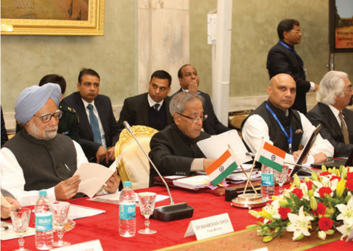
Shri Pranab Mukherjee, the President of India, attending the Conference of Vice Chancellors of Central Universities at Rashtrapati Bhavan in New Delhi on February 5, 2013. Also seen are Dr. Manmohan Singh, the Prime Minister of India and Dr. M. M. Pallam Raju, the Minister of HRD.

At the one-day conference of Vice Chancellors (VCs) of Central Universities (CUs), held on February 5, 2013 at Rashtrapati Bhawan, a detailed set of recommendations were put forth on main agenda items. Shri Pranab Mukherjee, the President of India, who is the Visitor of the CUs, thanked the VCs for their recommendations and said that the Ministry of HRD would examine them in detail for their speedy implementation. He also announced that the VCs conference would be made an annual exercise and a committee of VCs would be set up to follow up on the recommendations. VCs of the CUs exchanged their views in presence of President Mukherjee as well as Dr. Manmohan Singh, the Prime Minister of India and Dr. M. M. Pallam Raju, Minister of HRD.