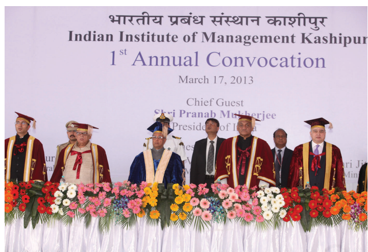
Shri Pranab Mukherjee, the President of India, at the First Convocation of Indian Institute of Management (IIM), Kashipur, in Kashipur, Uttarakhand on March 17, 2013.

The Indian Institute of Management, Kashipur, held its first-ever Convocation on March 17, 2013. On this occasion, Shri Pranab Mukherjee, the President of India was the Chief Guest.