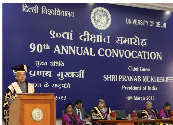
Shri Pranab Mukherjee, the President of India, at the 90th Annual Convocation of University of Delhi, in New Delhi on March 19, 2013.

The University of Delhi held its 90th Annual Convocation on March 19, 2013, which was attended by Shri Pranab Mukherjee, the President of India and a host of other dignitaries.