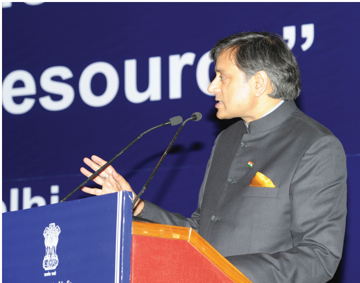
Dr. Shashi Tharoor, Minister of State for HRD, addressing the International Conference on Community Colleges, in New Delhi on February 6, 2013.

Dr. Shashi Tharoor, Minister of State for HRD, pointed toward the huge demographic advantage that India enjoys in comparison to countries like China, South Korea and Japan. However, he said, in order to ensure that this demographic advantage reached its full potential, the country needs to promote quality education by putting up the necessary infrastructure.