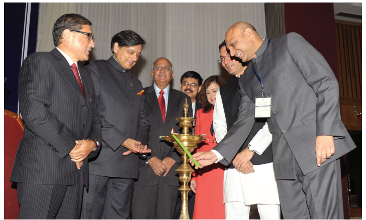
Dr. M. M. Pallam Raju, Minister of HRD, lighting the lamp to inaugurate the International Conference on Community Colleges in New Delhi on February 6, 2013. The Ministers of State for Human Resource Development, Dr. Shashi Tharoor and Shri Jitin Prasada are also seen.

The International Conference on "Mainstreaming Skills in Education: Creating relevant Human Resource" was held in New Delhi February 6 and 7, 2013. While inaugurating the conference, Dr. M. M. Pallam Raju, Minister of HRD, said that in the wake of the role of education in capacity building of youth, the Government has decided to launch 200 community colleges in the country from the next academic session, 2013.