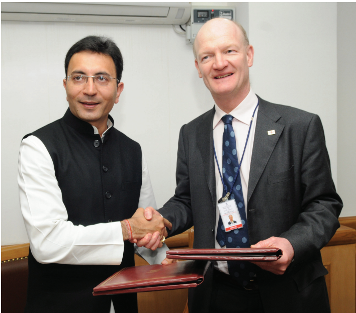
Shri Jitin Prasada, Minister of State for HRD and Mr. David Willetts, Minister of Universities and Science, UK, exchanging the signed documents of the Indo-UK MoU on HRD, in New Delhi on February 20, 2013.

In order to promote development of Community Colleges and implementation of School Leadership programme between India and the UK, two MoUs were signed between the two governments on February 20, 2013. Shri Jitin Prasada, Minister of State for HRD and Mr. David Willetts, Minister for Universities and Science, United Kingdom, signed the MoUs on behalf of their respective governments.