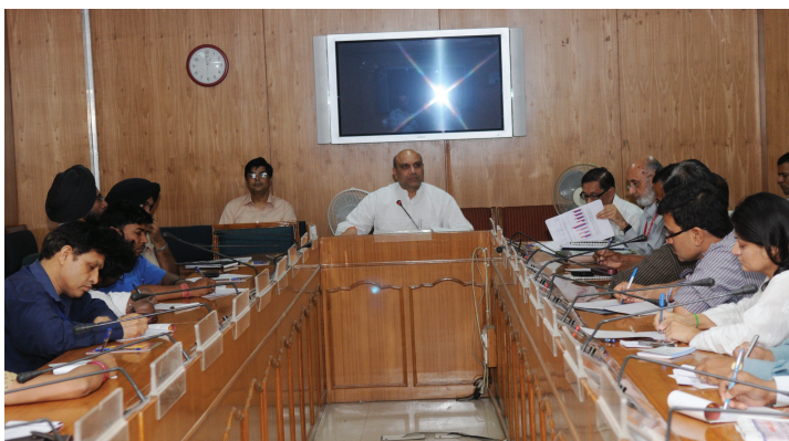
Dr. M. M. Pallam Raju, Minister of HRD, interacting with the Print Media, in New Delhi on March 22, 2013.