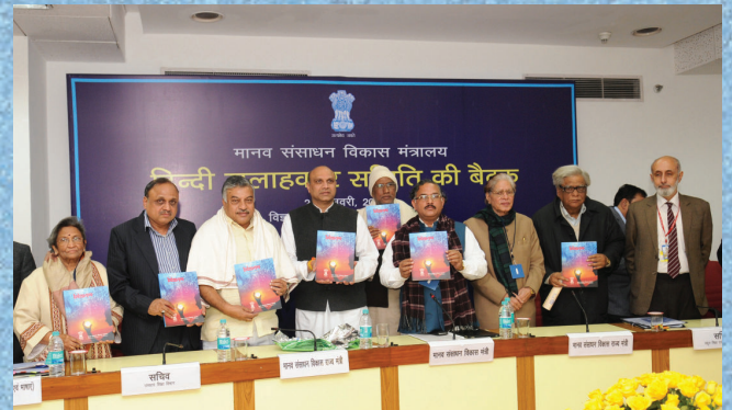
Dr. M. M. Pallam Raju releasing the annual report at the meeting of the Hindi Salahkar Samiti, in New Delhi on January 21, 2013

Focus on skills within the Higher Education, setting up of community colleges and polytechnics are also on the agenda in the XII Plan.