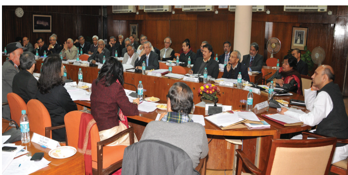
Dr. M. M. Pallam Raju, Minister of HRD, addressing the 46th meeting of the Council of IITs, in New Delhi on January 7, 2013.

At the 46th Meeting of the Council of IITs on January 7, 2013, Dr. M. M. Pallam Raju, Minister of HRD, emphasised upon the improving standards of technical education in the country, "IITs should strive for greater industry linkages." Dr. Raju, who chaired the meeting, said in his inaugural address that both the quality and quantity of faculty hold the key to better technical education.