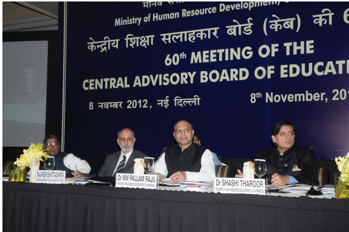
Dr. M. M. Pallam Raju, Minister of HRD and Dr. Shashi Tharoor, Minister of State of HRD at the 60th Meeting of the Central Advisory Board of Education (CABE), in New Delhi on November 8, 2012.

At the 60th meeting of the CABE, which is the highest advisory body to advise the Central and State Governments, the following resolutions were adopted after extensive deliberations between participants: