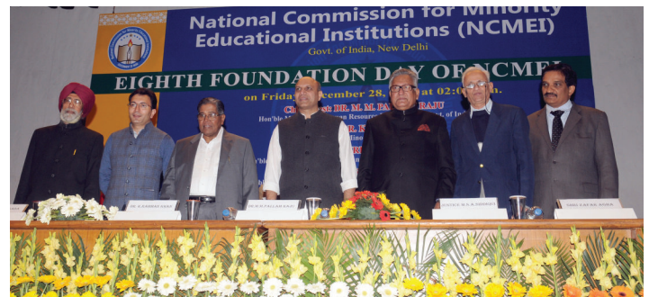
Dr. M. M. Pallam Raju, Minister of HRD, Shri Jitin Prasad, Minister of State of HRD, and other dignitaries at the 8th Foundation Day of the National Commission for Minority Educational Institutions, in New Delhi on December 28, 2012.

At the Eighth Foundation Day function of the National Commission for Minority Educational Institutions (NCMEI) on December 28, 2012, Dr. M. M. Pallam Raju, Minister of HRD, sought the participation and co-operation of the general public in promoting the educational welfare of the Minorities, in general and the Muslims, in particular. While addressing the audience at the function, Dr. Raju said, "The XI Five Year Plan had also underlined that education is the critical factor that empowers participation in the growth process and a key element of XI Plan strategy was to provide essential education to those large parts of our population who are still excluded from these."