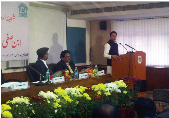
Sh. Jitin Prasad, MoS of HRD, speaking at the inaugural function of 'Ibn-e-Safi' Seminar at Jamia Millia Islamia, in New Delhi on December 14, 2012.

Sh. Jitin Prasad, MoS of HRD, inaugurated the 3-day seminar on bestselling Urdu fiction writer 'Ibn-e-Safi', organized by Department of Urdu, Jamia Millia Islamia (JMI), in collaboration with the Urdu Academy, Delhi. Sh. Prasad was the Chief Guest for the occasion while Sh. Najeeb Jung, Vice-Chancellor, JMI, presided over the inaugural session.