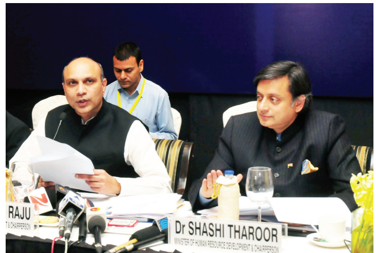
Dr. M. M. Pallam Raju, Minister of HRD and Dr. Shashi Tharoor, Minister of State of HRD at the 60th Meeting of the Central Advisory Board of Education (CABE), in New Delhi on November 8, 2012.

The Sixtieth Meeting of the Central Advisory Board of Education (CABE) was held on November 8, 2012, under the chairmanship of Dr. M. M. Pallam Raju, Minister of HRD.