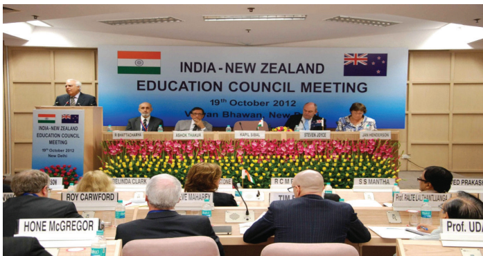
Shri Kapil Sibal, the then Minister of HRD, addressing the meeting, in New Delhi on October 19, 2012.

India and New Zealand co-chaired a meeting of the Joint Education Council on October 19, 2012. While Sh. Kapil Sibal, the then Minister of HRD, represented the Government of India, Mr. Steven Joyce, Minister of Tertiary Education, Skill and Employment represented New Zealand government at the meeting.