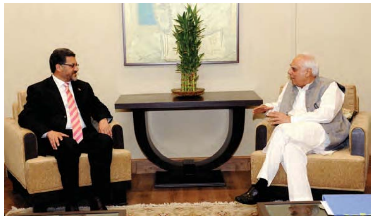
Shri Kapil Sibal, Minister of HRD, in a meeting with Mr. Farook Wardak, Minister of Education, Afghanistan, in New Delhi on September 11, 2012.