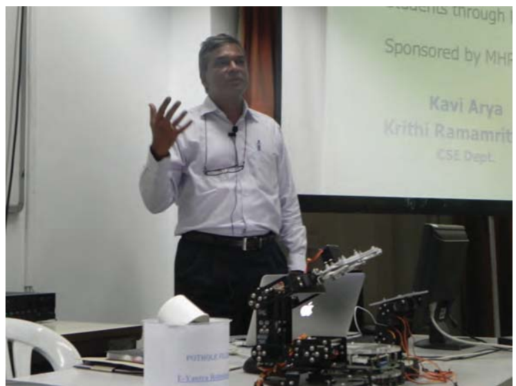
A Faculty member explaining the e-Yantra concept to the participants at IIT Bombay.

On July 3, 2012, IIT Bombay (IITB) announced the launch of 'E-Yantra' - an all India challenge on robotics. The initiative is different in its format in that the students participating in this challenge don't have to build a