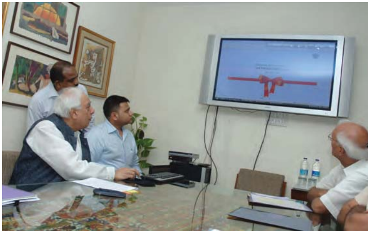
Shri Kapil Sibal, Minister of HRD, launching the anti-ragging web portal, in New Delhi on July 26, 2012.

The Supreme Court of India has expressed concern over the increasing incidents of ragging in educational institutions and on May 8, 2009, the SC ordered a ragging prevention programme to be launched to prevent ragging on the campuses across the country. In this regard, Shri Kapil Sibal, Minister of HRD, inaugurated the Anti-Ragging Web Portal on July 26, 2012. The portal, which has been developed jointly by the UGC, the EdCIL (India) Ltd. and Planet E-Com Solutions, will be instrumental in checking the growth of ragging incidents in the institutions.