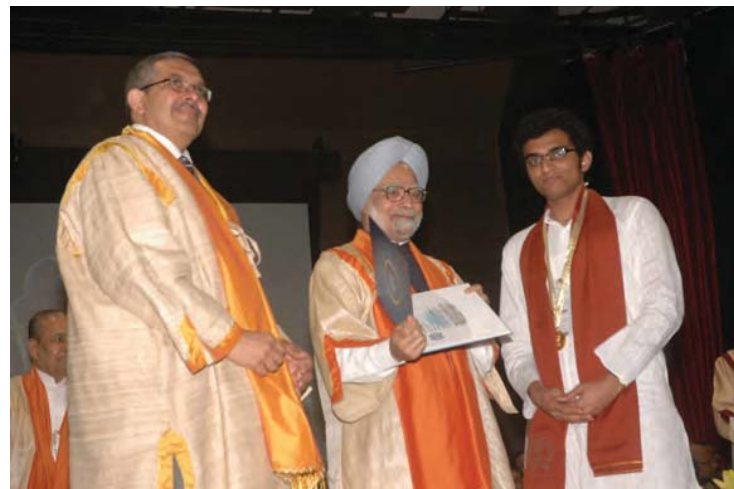
Shri Manmohan Singh, Hon'ble Prime Minister of India, awarding one of the degrees at the IITB Golden Jubilee Annual Convocation ceremony on August 18, 2012.