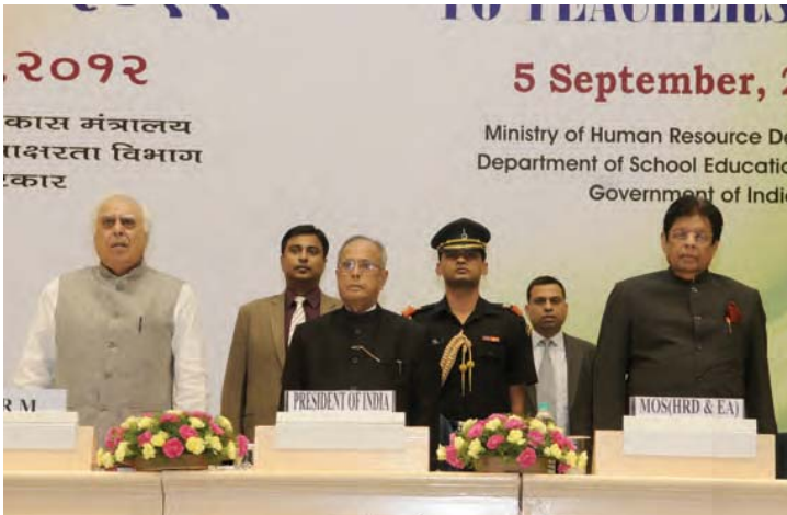
President Shri Pranab Mukherjee, Shri Kapil Sibal, Minister of HRD, and Shri E. Ahamed, Minister of State for HRD, during the presentation ceremony of the National Awards to Teachers 2011 on September 5, 2012.

In order to build “the India of our dreams,” we need to “improve the quality of education in the country.” That is the foremost task laid down by the Hon’ble President Shri Pranab Mukherjee as he addressed teachers on the occasion of the National Awards to Teachers 2011 ceremony on September 5, 2012.