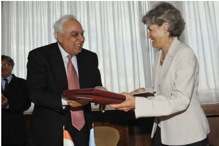
Shri Sibal and Ms. Bokova exchanging the signed documents of the agreement for setting up MGIEP on July 9, 2012.

Shri Kapil Sibal, Minister of HRD, signed an agreement for setting up the Mahatma Gandhi Institute of Education for Peace and Sustainable Development (MGIEP) as a UNESCO Category-I Institute on July 9, 2012 in Paris. The Institute will be the first of its kind in the Asia Pacific region and it will be established in New Delhi. While signing the agreement, Shri Sibal said, "The challenges of the 21st century are qualitatively different from the challenges of the 20th century. Global understanding and education would assist in appreciating the impact of these challenges on peace and its relation to sustainable development. The MGIEP comes at the right time - a time when the world is debating the contours of the century ahead." The agreement was signed between Shri Sibal and Ms. Irina Bokova, the Director General of UNESCO.