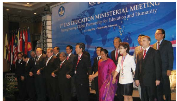
Dr. (Smt.) D. Purandeswari, with other Ministers of the EAS countries at the First EAS Education Ministers' Meeting in Yogyakarta, Indonesia on July 5, 2012.

An Indian delegation, led by Dr. (Smt.) D. Purandeswari, Minister of State for HRD, attended the First East Asia Summit Education Ministers' Meeting (EAS EMM). While addressing the meeting, the Minister said that it was time to boost educational cooperation among the member countries of EAS. In this regard, she suggested that issues such as credit transfer, mutual recognition of degrees, free flow of highly qualified people, earmarking of seats for students, setting up corpus fund to promote research, to be taken care of while evolving cooperation strategy between countries.