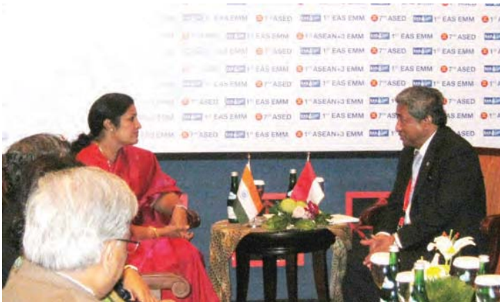
Dr. (Smt.) D. Purandeswari in a meeting with Prof. Muhammad Nuh, Indonesian Minister for Education and Culture on July 4, 2012.

informed the participants of its plans to link the National Qualification Framework (NQF) to the regional framework development, to encourage Regional Inter-Operability of the NQF.