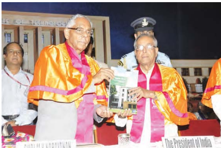
Shri Pranab Mukherjee, Hon'ble President of India, releasing the IIT-KGP document along with Shri M. K. Narayanan, Hon'ble Governor of West Bengal at the IIT-KGP Annual Convocation on September 15, 2012.

On September 15, 2012, the Indian Institute of Technology, Kharagpur (IIT-KGP), held its 58th Annual Convocation with Shri Pranab Mukherjee, Hon'ble President of India, as the Chief Guest. Among other guests on the occasion was Shri M. K. Narayanan, Hon'ble Governor of West Bengal.