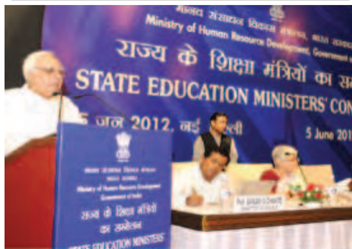
Shri Kapil Sibal, Minister of HRD, addressing the State Education Ministers' Conference in New Delhi on June 5, 2012.

At the State & UT Education Ministers' Conference, held on June 5, 2012, Shri Kapil Sibal, Minister of HRD, emphasized the importance of centrality of State Governments both in policy formulation as also in their effective implementation. He recalled the cooperation extended by the State Governments in the Education sector and thanked all the State Education Ministers for the same. With education being a Concurrent subject, Shri Sibal maintained that consultations and continuous dialogue with the States becomes crucial in a federating structure. He added that such interactions had been extremely useful in shaping the initiatives and policies of the Ministry, ranging from the Right to Education to the various reforms in Higher Education.