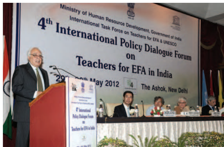
Shri Kapil Sibal, Minister of HRD, addressing the Fourth International Policy Dialogue on Teacher Challenges for Education for All in India on May 29, 2012.

Outlining the fact that a lot needs to be done in the