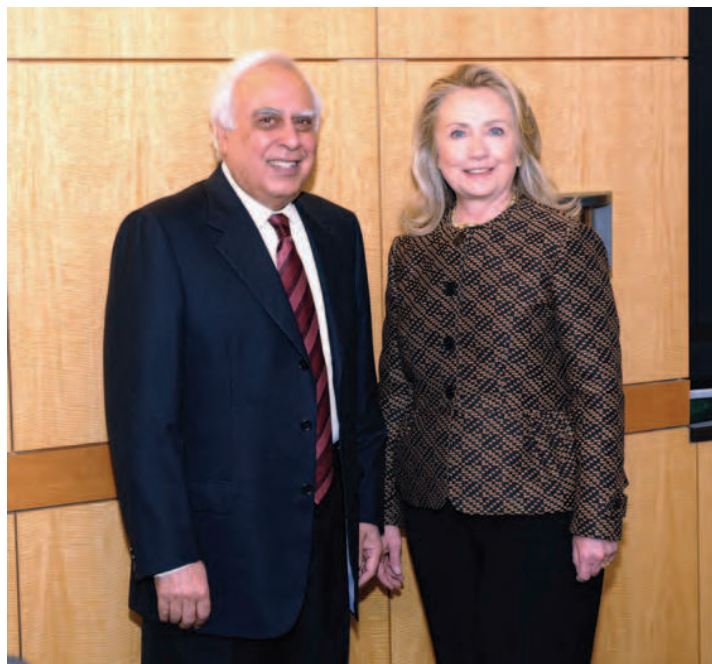
Shri Sibal and Ms Clinton during the deliberations under the Indo-US Higher Education Dialogue.