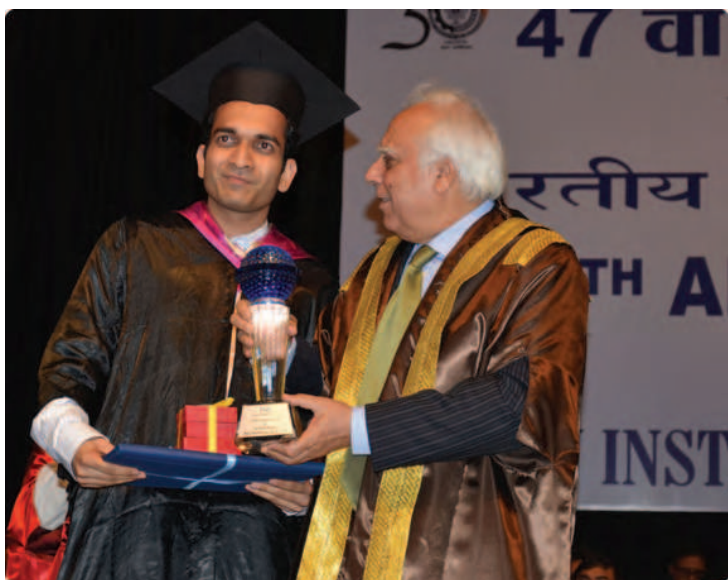
Shri Kapil Sibal, Minister of HRD, giving away the gold medal, at the 47th Annual Convocation of Indian Institute of Management (IIM), Joka, in Kolkata on April 2, 2012.

At the Conference, the Vice Chancellors agreed unanimously that there was need for accreditation of the Central Universities to advance academic quality and act as examples for the Higher Education sector in India. Besides, the meeting also dwelt at length on the adequacy and effective deployment of funds, especially in the field of research and innovation. At the conference, it was decided that common problems like absence of pension portability under the NPS in the Central Universities set up after 2004 could be taken up at the level of Government.