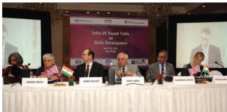
Shri Kapil Sibal, Minister of HRD, and other dignitaries at the India-UK Round Table on Innovation and Skills Development, in New Delhi, on April 20, 2012.

On April 20, 2012, Shri Kapil Sibal, Minister of HRD, presided over the India-UK Round Table Conference on Innovation and Skill Development. The Round Table was a part of the UK-India Education and Research Initiative (UKIERI).