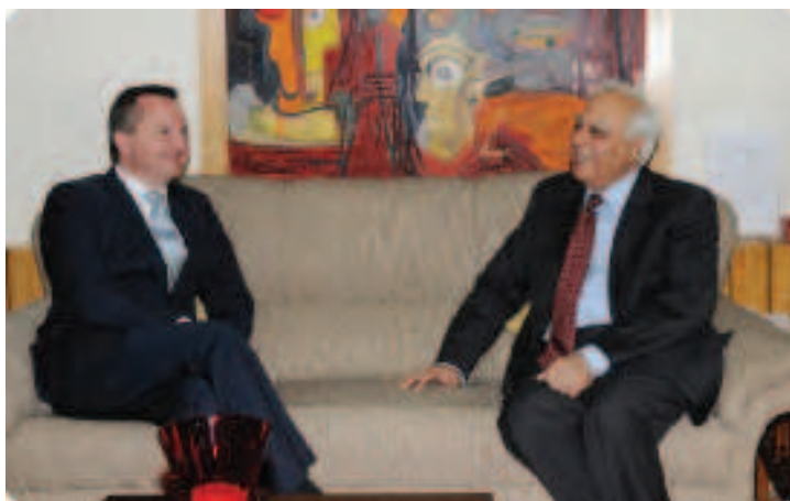
Shri Kapil Sibal, Minister of HRD, giving away the gold medal, at the 47th Annual Convocation of Indian Institute of Management (IIM), Joka, in Kolkata on April 2, 2012.