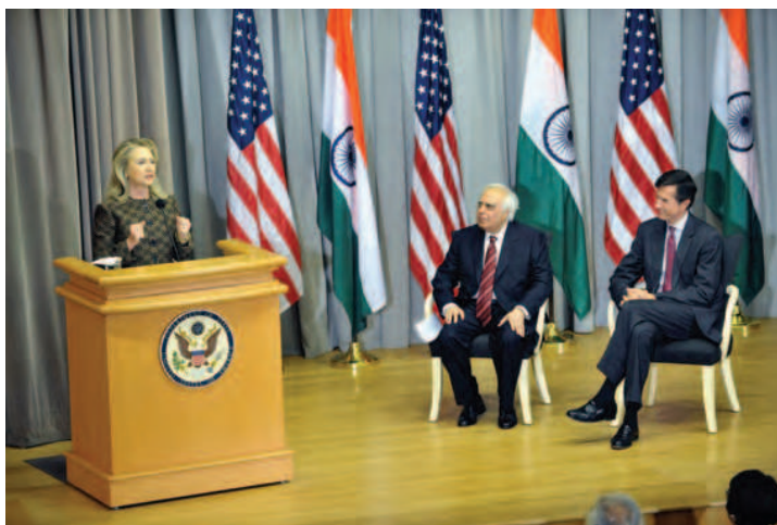
Shri Kapil Sibal, Minister of HRD, is seen on the dais as Ms Hillary Clinton, US Secretary of State addressed the Indo-US Higher Education Dialogue in Washington, D.C. on June 12, 2012.

Taking the educational partnership between India and the US a step forward, the second Indo-US Higher Education dialogue was held in Washington, D.C., United States, on June 12, 2012. Shri Kapil Sibal, Minister of HRD and US Secretary of State, Ms Hillary Clinton, were co-chair at the dialogue.