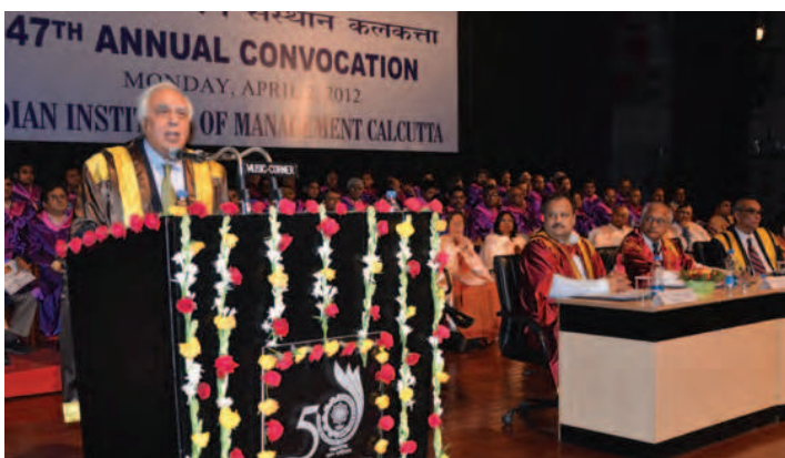
Shri Kapil Sibal, Minister of HRD, addressing the 47th Annual Convocation of Indian Institute of Management, Kolkata, on April 2, 2012.